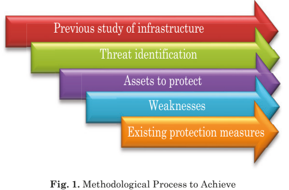
the Risk Matrix of the Port of Manta.

The stages for this method are summarized in Fig. 1: